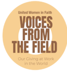
Voices From the Field