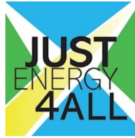
Just Energy for All