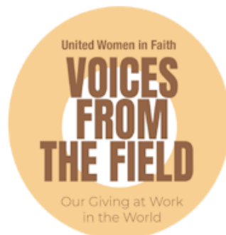
Voices From the Field