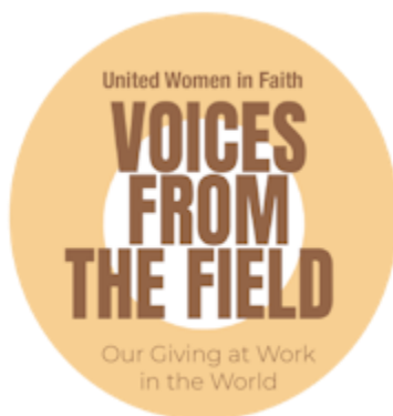
Voices From the Field