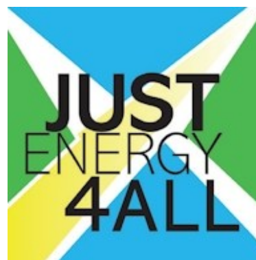
Just Energy for All

For information and dates click under section images above to open each site.