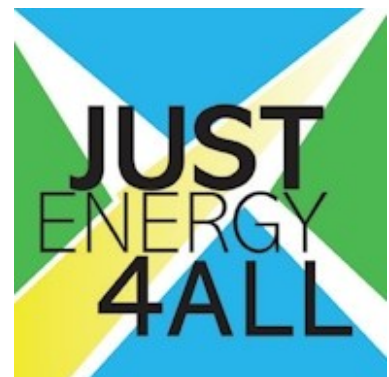
Just Energy for All