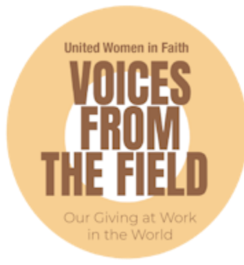
Voices From the Field