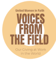
Voices From the Field