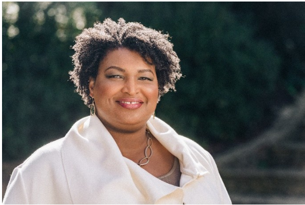
Stacey Abrams-Keynote Speaker

Visit UWFaith.org/Assembly to learn more Stacey Abrams, Workshops, Soul Care, Town Halls, & More. Registration Now Open, Early Bird Pricing Through November 30, 2025!