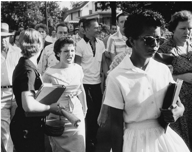
Unfortunately, this well-known photo from 1957