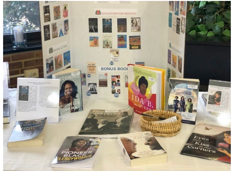
St. John's UWF library display