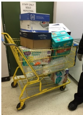
One of Two carts full from Prayer Breakfast Donations to Rising Hope UMC