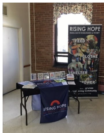
Rising Hope Display